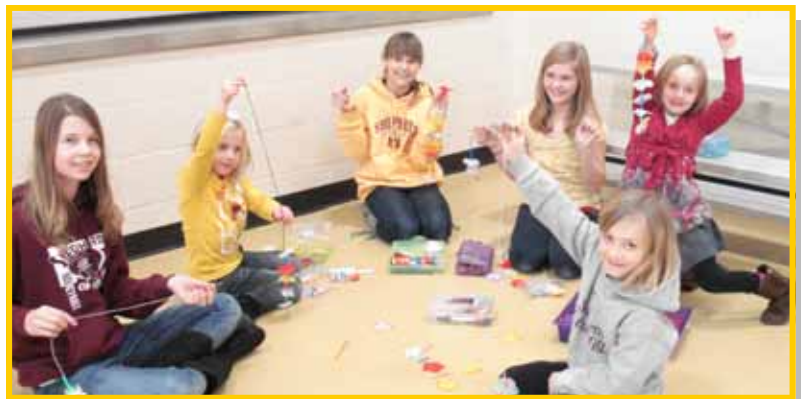
Making memories during Catholic Schools Week at Shepherd of the Hills: (Clockwise) All School Picture, First grade Door Decoration Contest (winners 1st grade and 7th/8th grade), Stringing leis for Hawaiian Day, Frankie the Walk & Roll Dog (a HUGE hit with the students), Second grade girls at the Luau Lunch, 3K putting together puzzles on Rainbow Day.